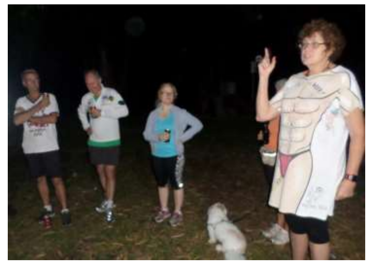
'Do you want dinner?' Wife : Husband: 'Sure! What are my choices?' Wife: 'Yes or no.'

When TRINITY HHH was first formed on 14 January 1980, 12 1/2 years after the first Australian Hash chapter in Sydney (9 October 1967), there were less than 200 chapters in the known Hashing world. As at 2016, There are more than 2000 Hash kennels (chapters) spanning all seven continents.