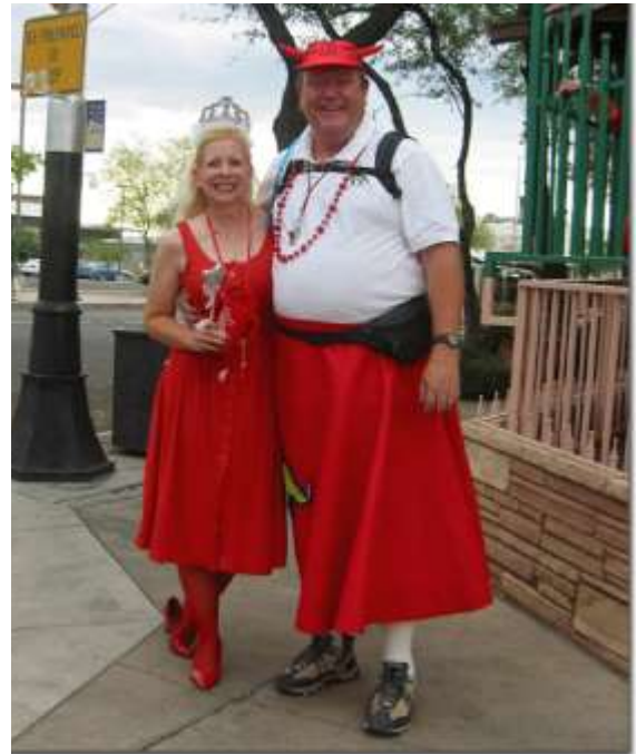
The Original "Lady in Red" with Flying Booger