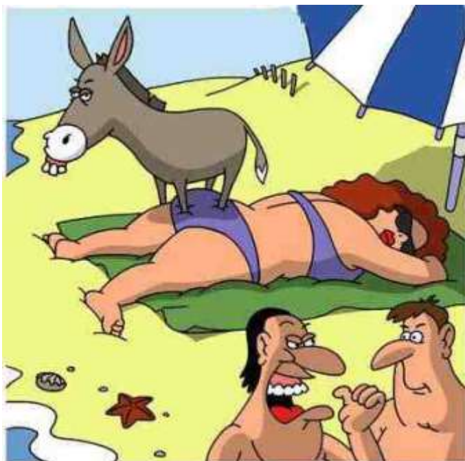
"Jeez, would you look at the ass on that girl!"